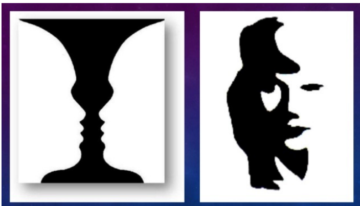
Face-off or Vase?