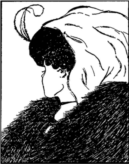
Old or Young?